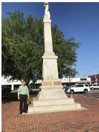
Troy Confederate Monument