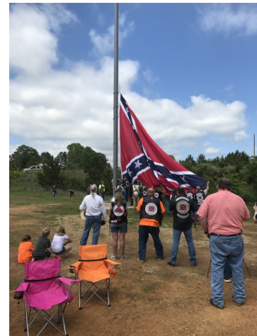
I-22 Flag Raising