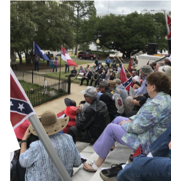
Part of the large crowd of 250 who attended the Confederate Memorial Day Ceremony.