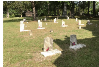
Camp 1921 placed Battle Flags on 28 graves of Soldiers at the Confederate Cemetery in Union Springs, Alabama.