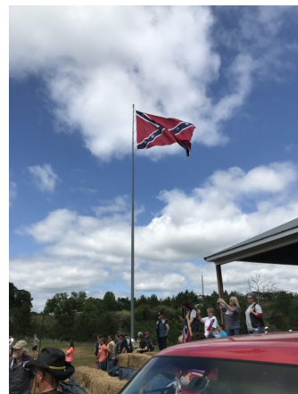
I-22 Flag Flying